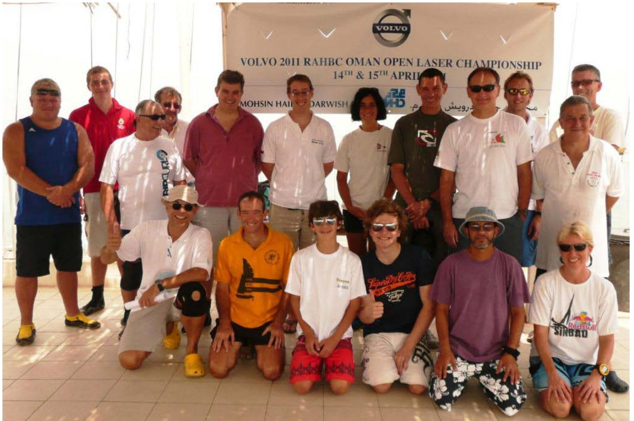
All the competitors before the start of the sailing