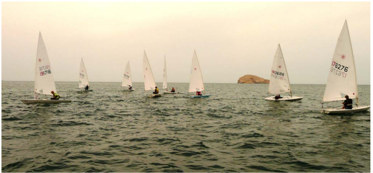
The fleet positioning itself prior to a start