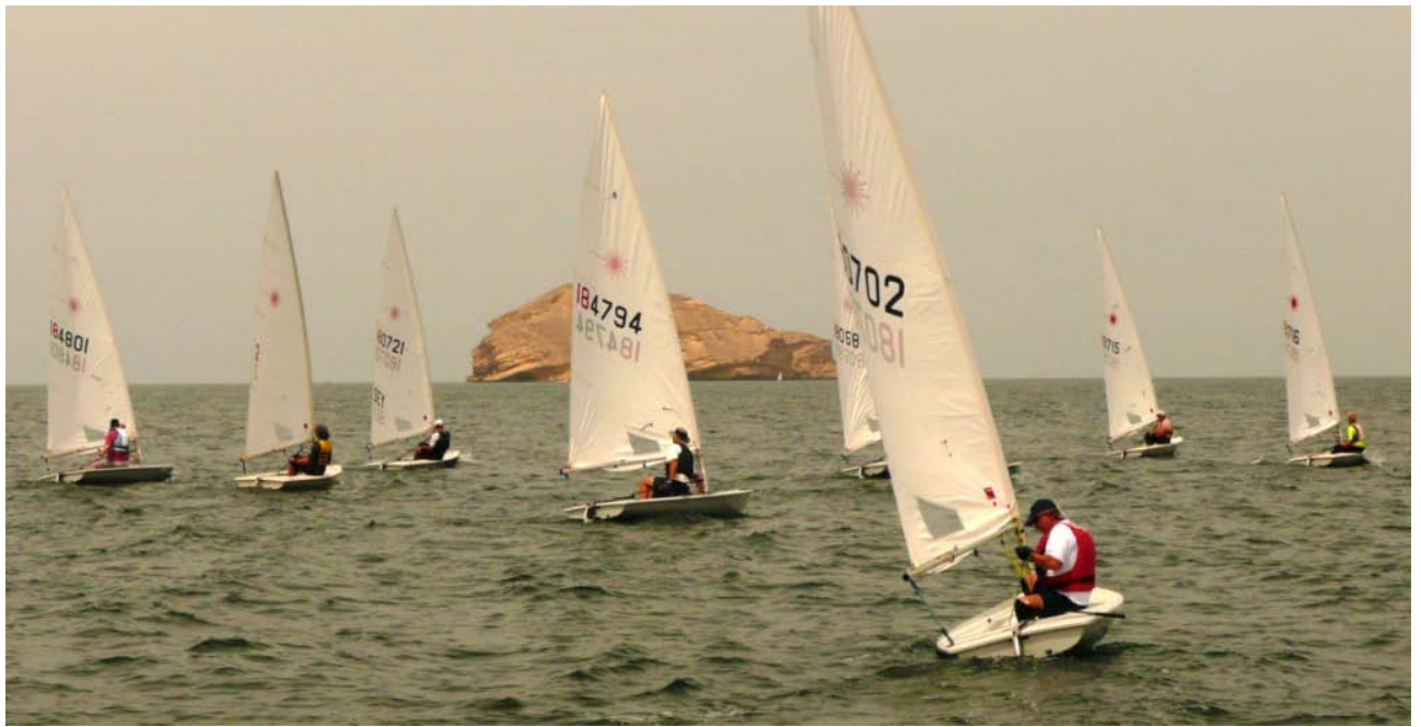
The fleet towards the up-wind buoy with Al Fahal island in the background