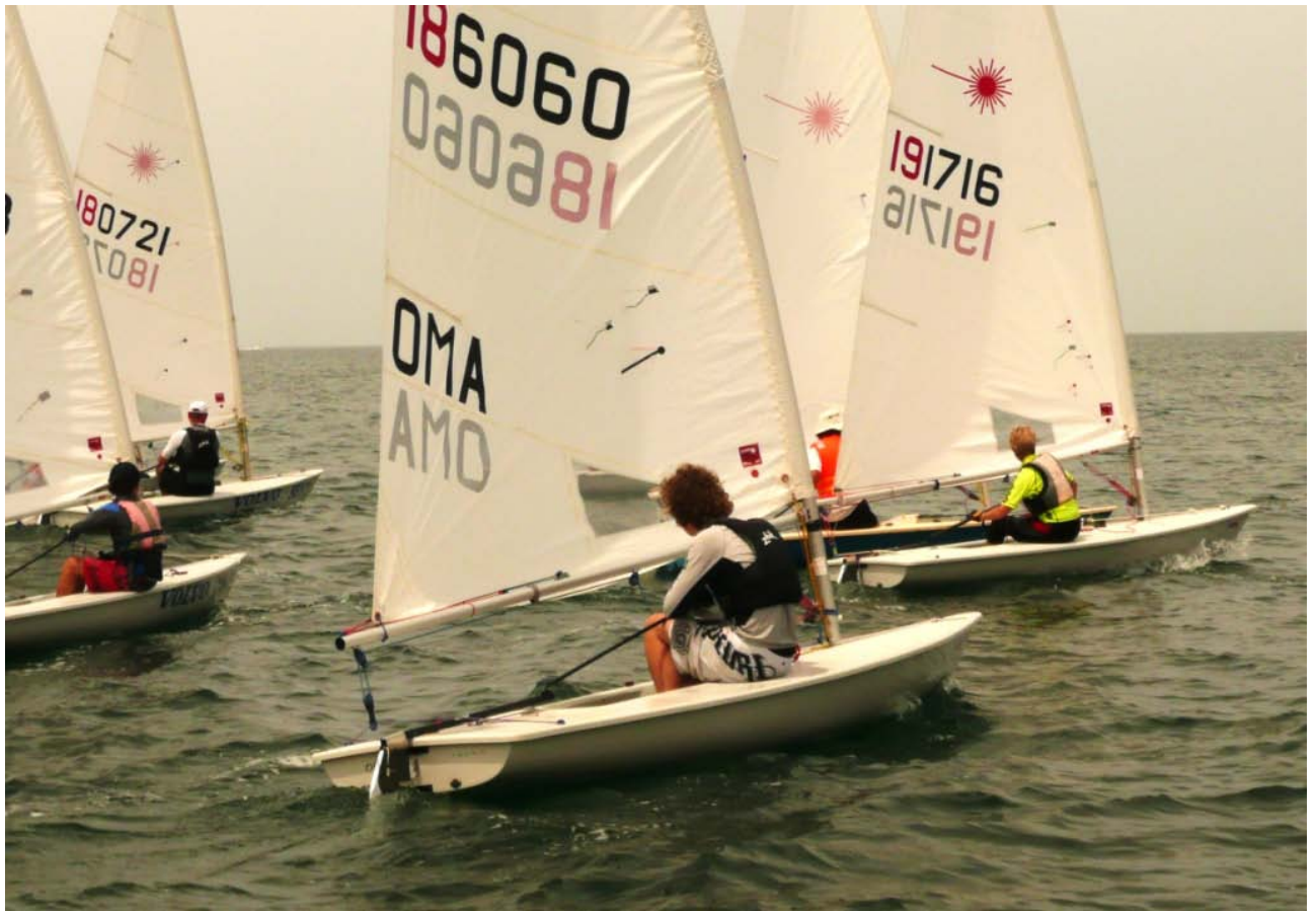
Tight sailing at a start