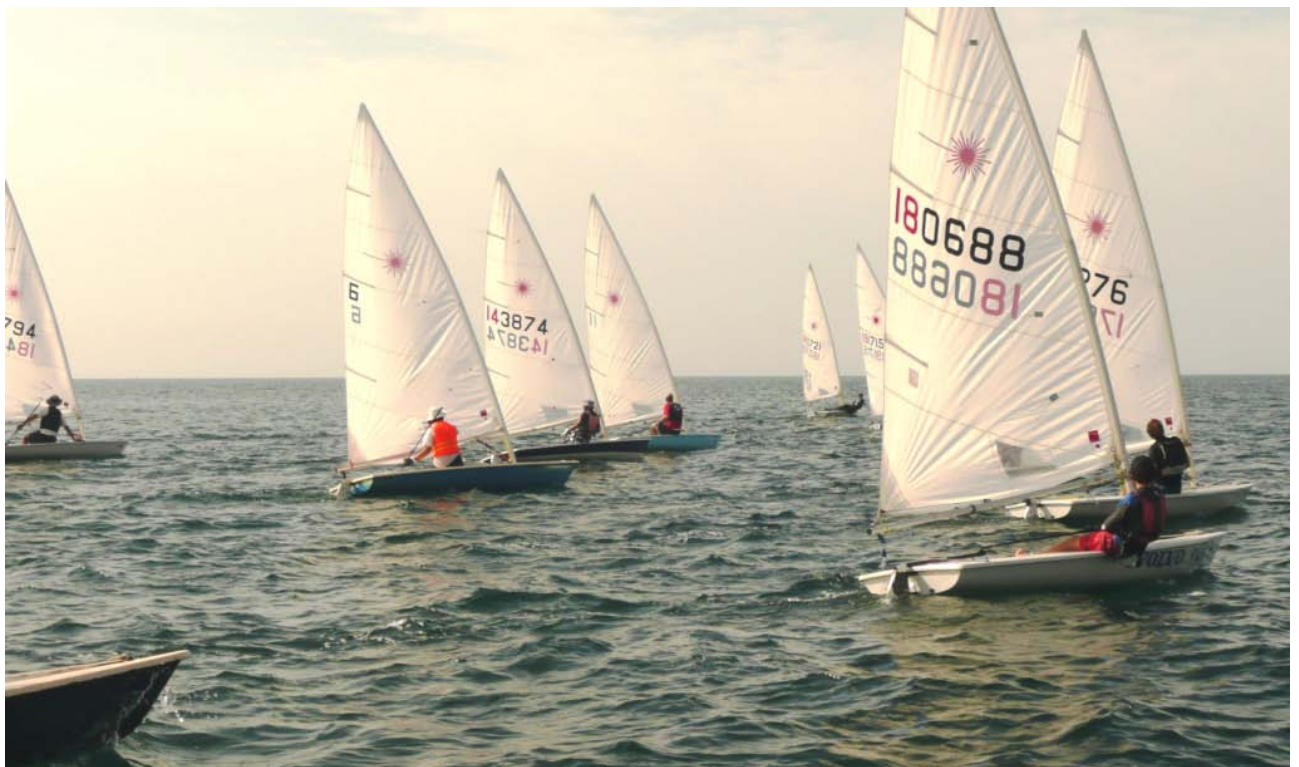
The fleet immediately after starting race 3